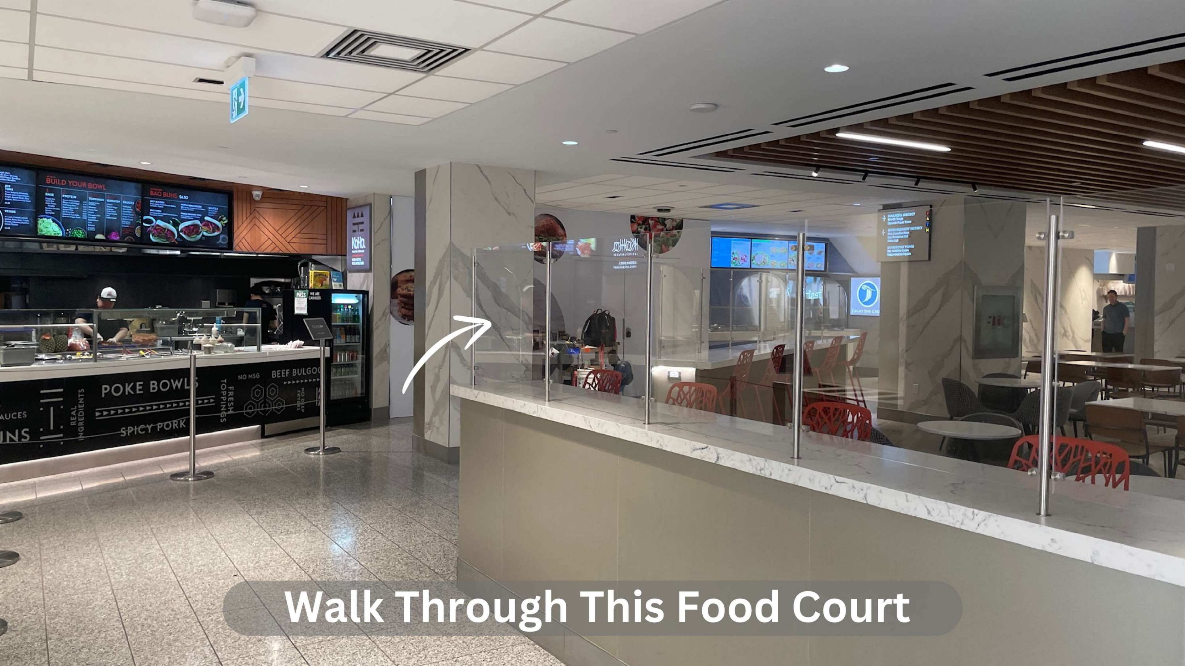
Walk Through This Food Court